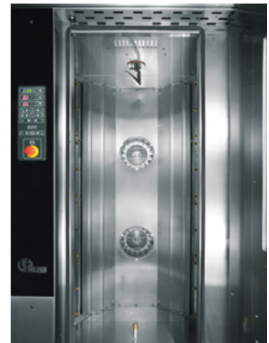
Dual Fan AirFlow System