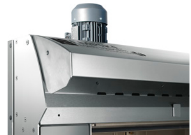
Steam Exhaust Canopy