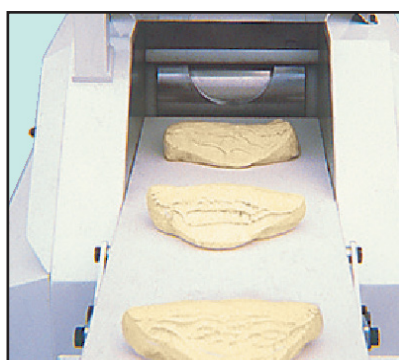
Designed to be Optimally Cleaned in Minutes