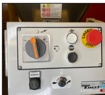
Electronic control panel with 50 custom programs