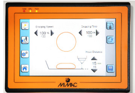
The Touch Screen Control Panel is intuitive, functional & very easy to use.