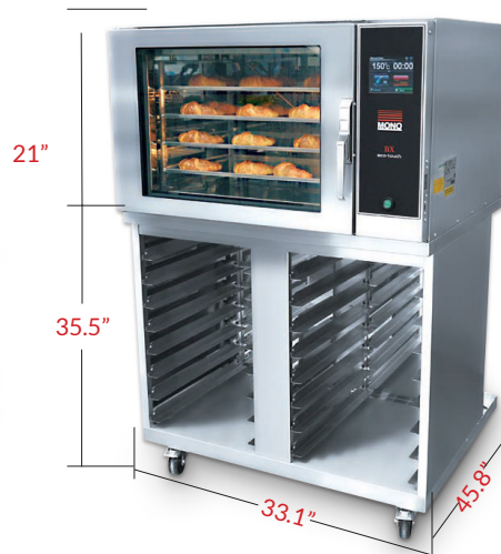
Model EMP-BX5T-ECO w/ stand