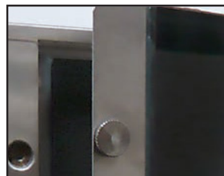
Twin pane, vented glass door with removable panel