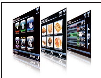
Easy to use ECO Touchscreen programmable control system