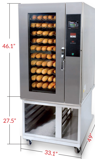
Model EMP-BX10T-ECO w/ stand