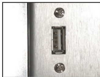
USB Functionality allows for convenient recipe replication