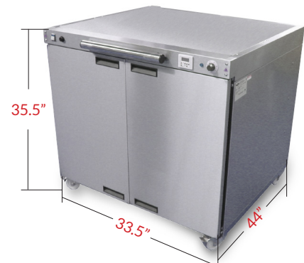
Model EMP-BX-PB Optional proofer base