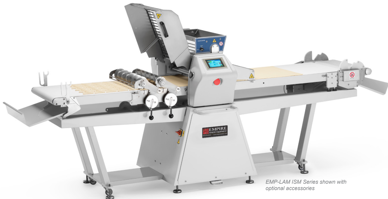
EMP-LAM ISM Series shown with optional accessories