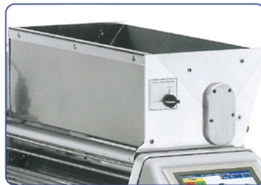
Automatic Flour Duster