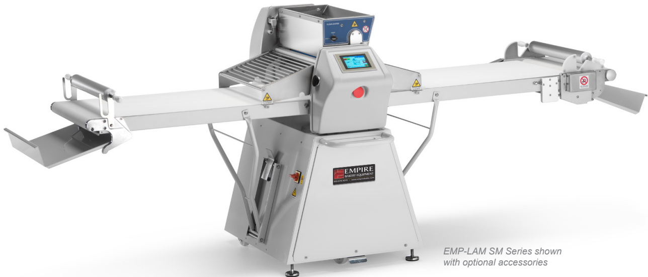
EMP-LAM SM Series shown with optional accessories